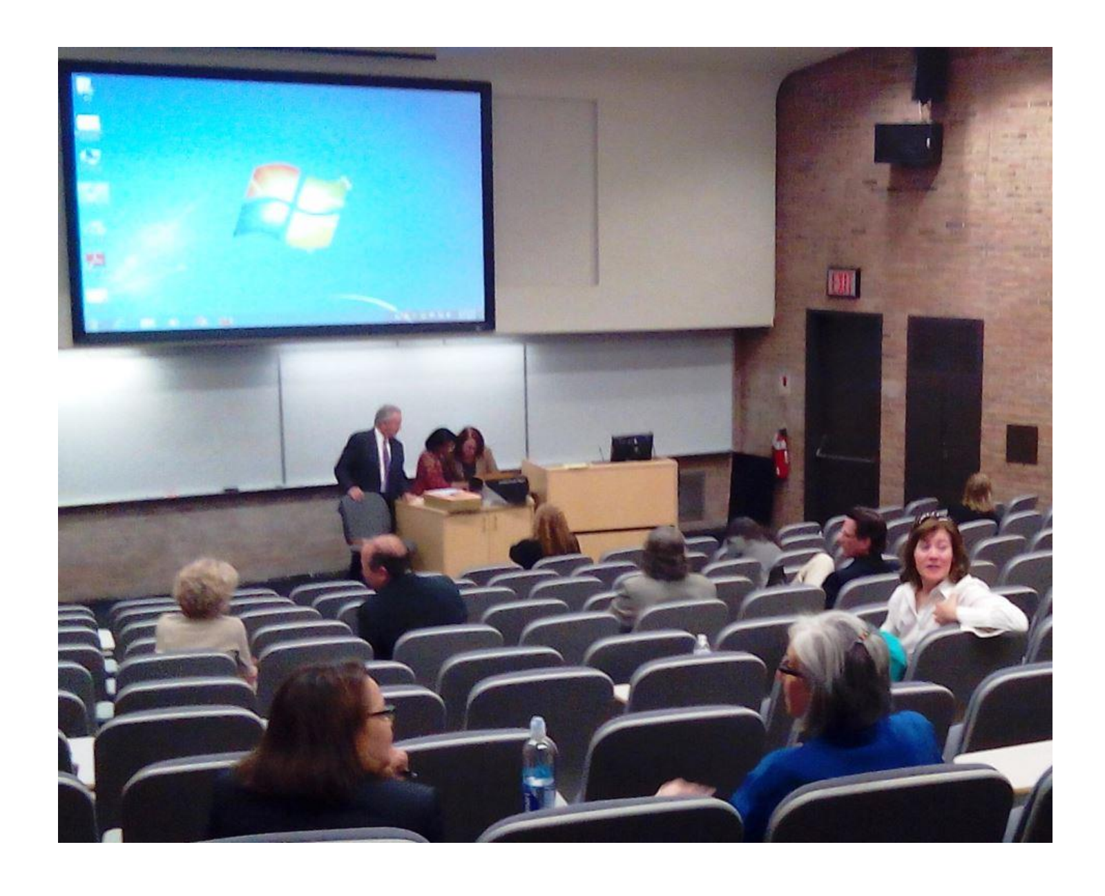
EXHIBIT K. Photographs of Tellers at the Podium during the election