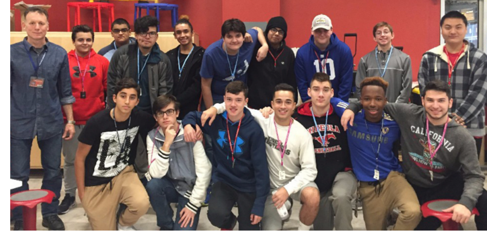
Mineola H.S. 10th graders entering the New Media Technology certificate program

and the multiple interfaces of media. The program combines instruction in technology, art, writing, programming, database and e-commerce, artistic layout and design and animation.