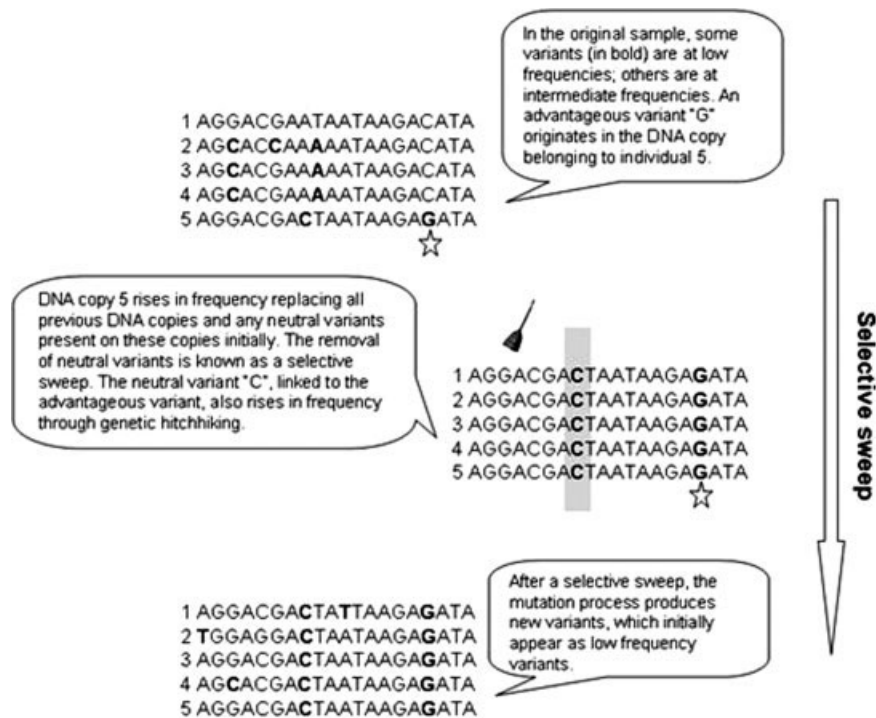
Figure 2. The effects of a positive selective sweep on the variants within a set of DNA sequences drawn from a population.

under selection is usually difficult to pinpoint since a signature may extend over a broad genomic region (for example, >100,000 base pairs).