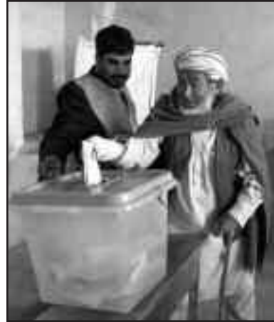
An Afghan man places his vote in the elections.