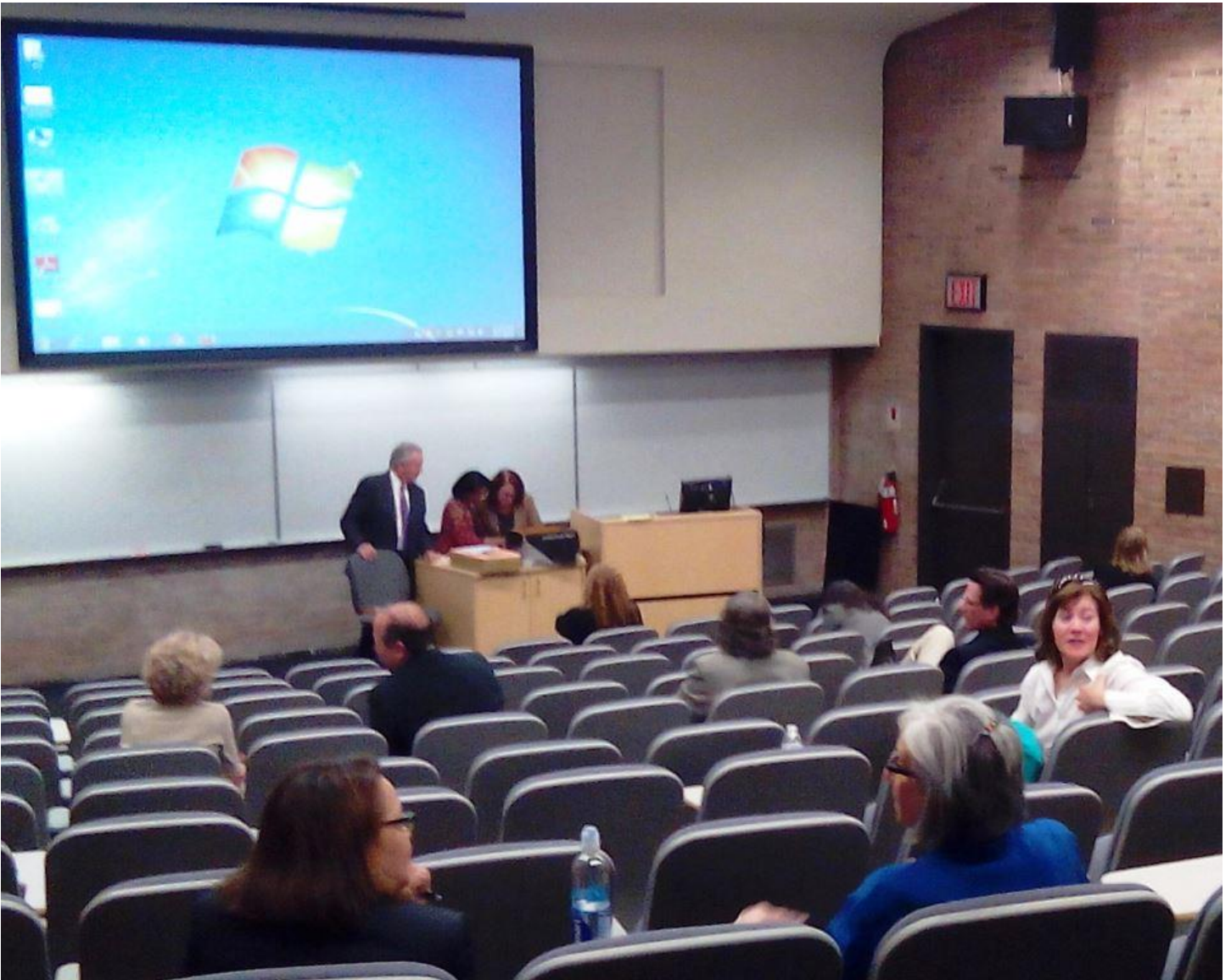
EXHIBIT K. Photographs of Tellers at the Podium during the election